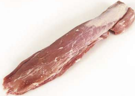
1 Fillet of pork.