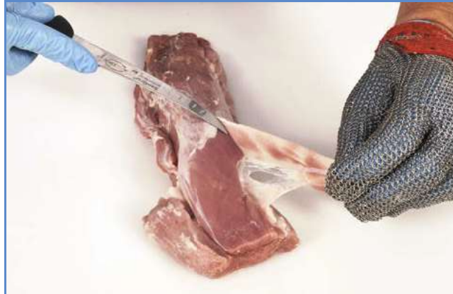
2 Remove the chain, silverskin and fat.