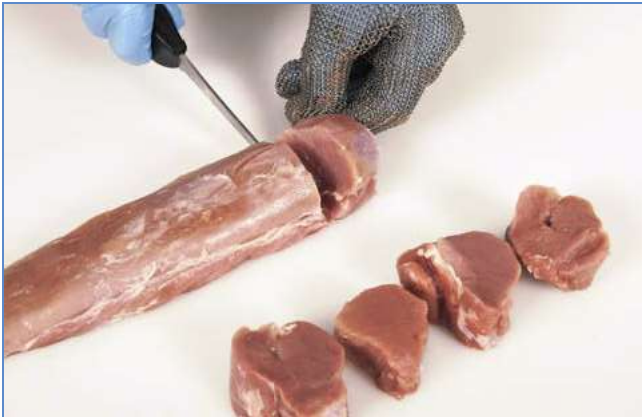
4 Cut fillet into ...