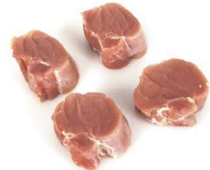
6 Fillet Medallions.