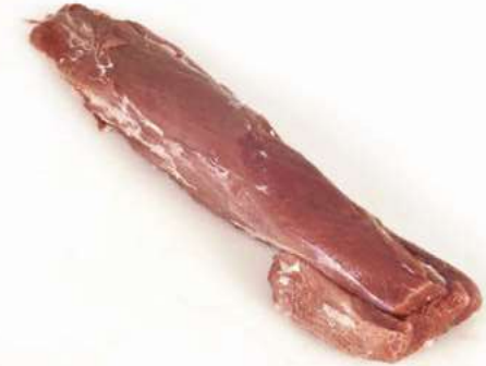
3 Fillet of pork fully trimmed.