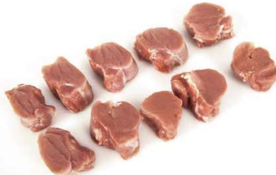
5 ... 25 mm thick medallions